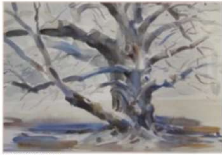
painting by Edith Munro